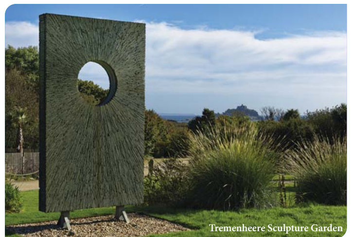
Tremeneere Sculpture Garden

This holiday is operated by Travel Editions Group Travel